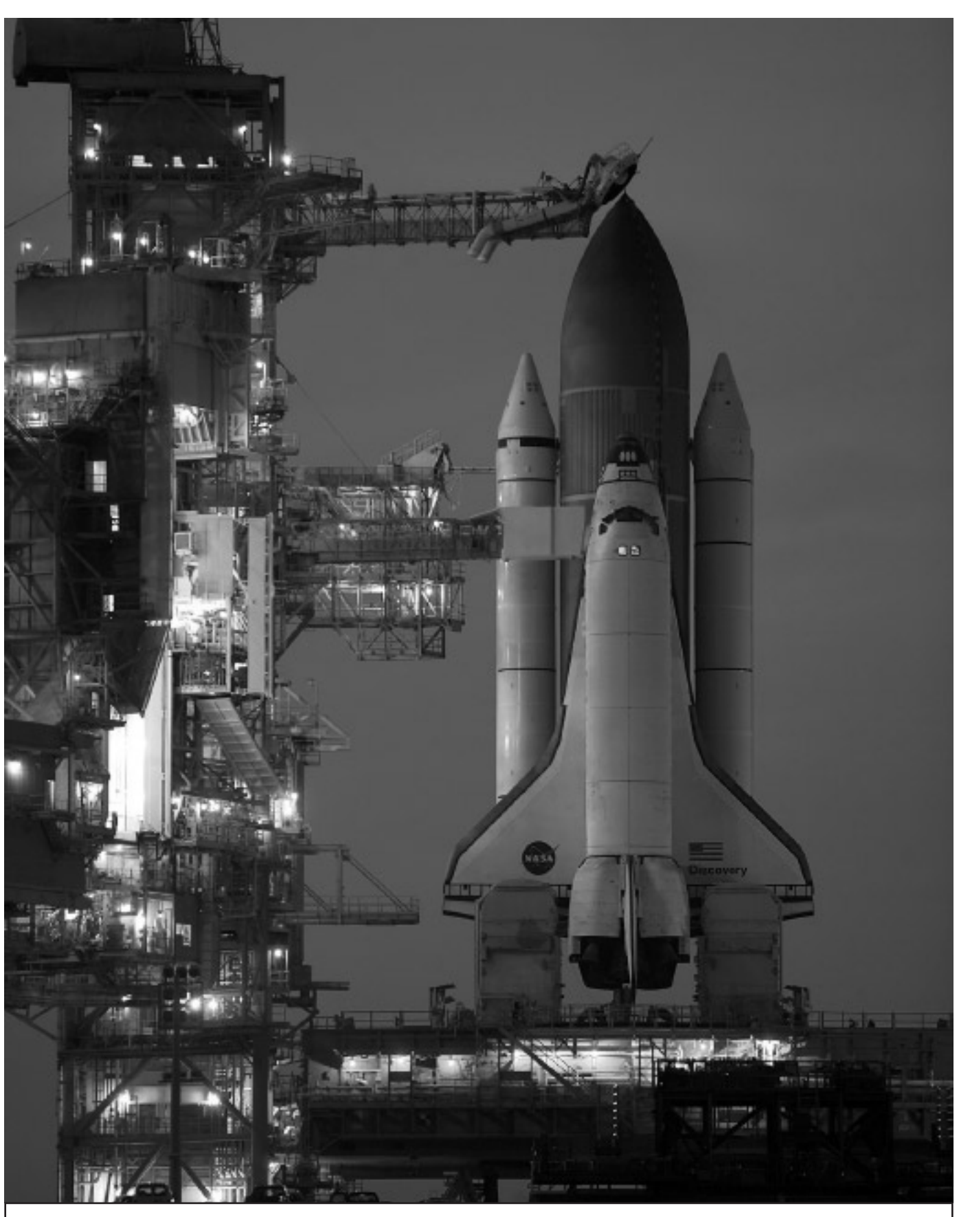
Discovery on pad, June 30, 2006. Photo taken with Canon 400mm. F/2.8,ISO 100, 1/200 Camera body was a Canon 1Ds MK II.