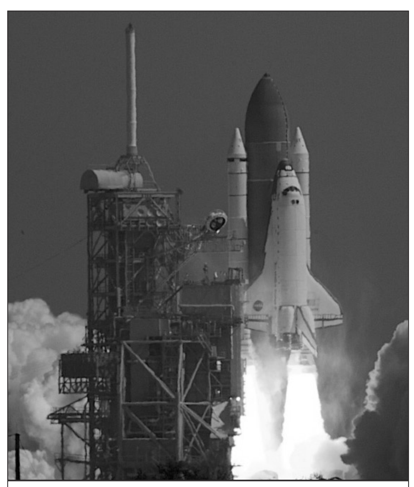
Space Shuttle Atlantis taking off on September 9, 2006. Camera is Canon 1Ds Mk II 1200mm F/6 1/2000 ISO 200.